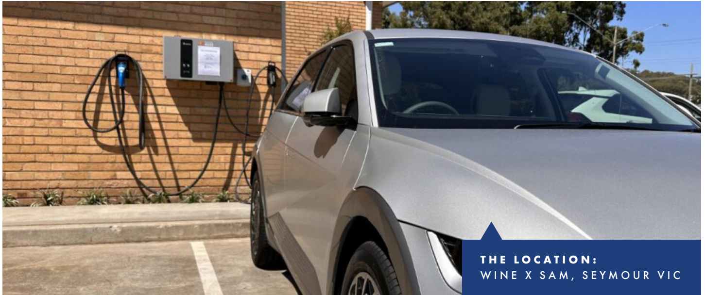
THE LOCATION: WINE X SAM, SEYMOUR VIC