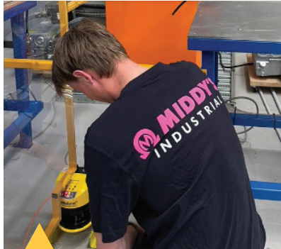
THE INSTALL: SAFETY CONTROL BOARD BUILD