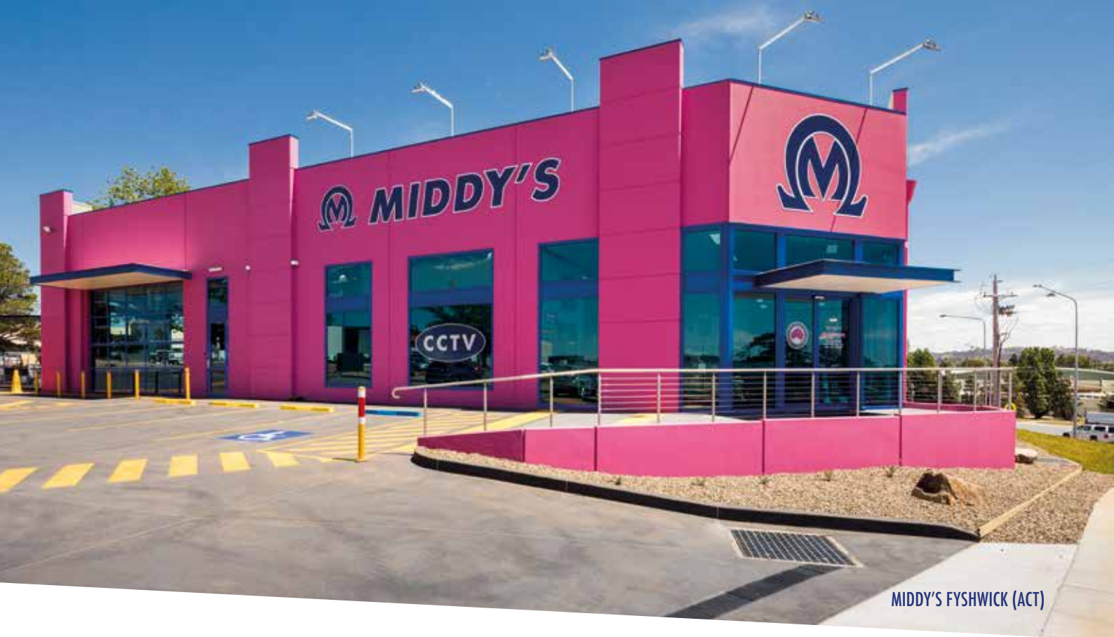
MIDDY'S FYSHWICK (ACT)